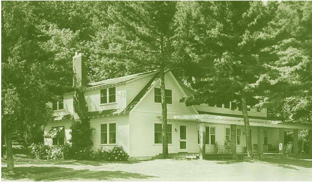
Kinney- Hardenbergh House, 2290 Crescent Beach Road