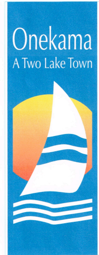
finished size - 48"t x 17"w

You can purchase half size Onekama Two Lake Town Banners at Main Street Sign Shop (next to the Onekama Shirt Shop) for $95 each. They are 48" tall and 17" wide and have a rod loop across the top for hanging. They are seamed on both sides and bottom. They can be shipped for an additional $20 shipping and handling fee. Call 231-889-0060 for more information.