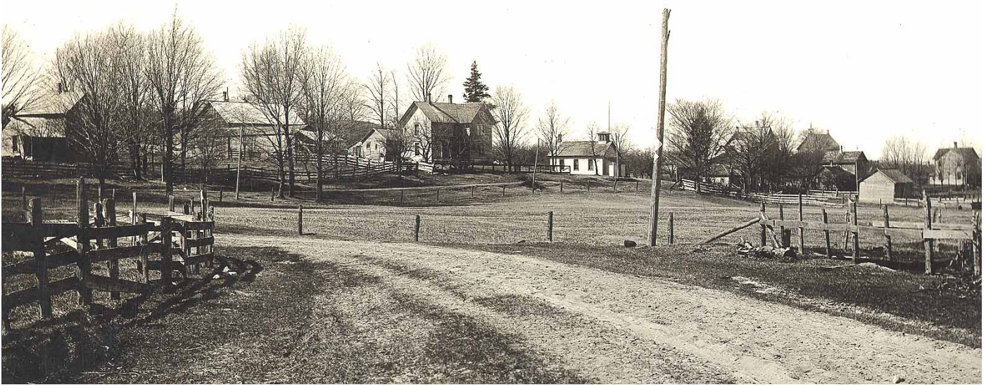
The Pierport School Is Shown Just Right of Center in This Early View of Pierport Looking Southwest