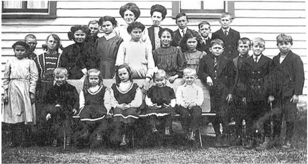
Students of 1909- 1910

has been converted into a residence. Many of the buildings of Pierport disappeared as the village declined rapidly starting in the 1890's and particularly after the demise of the Railroad (the rails were removed in 1902).