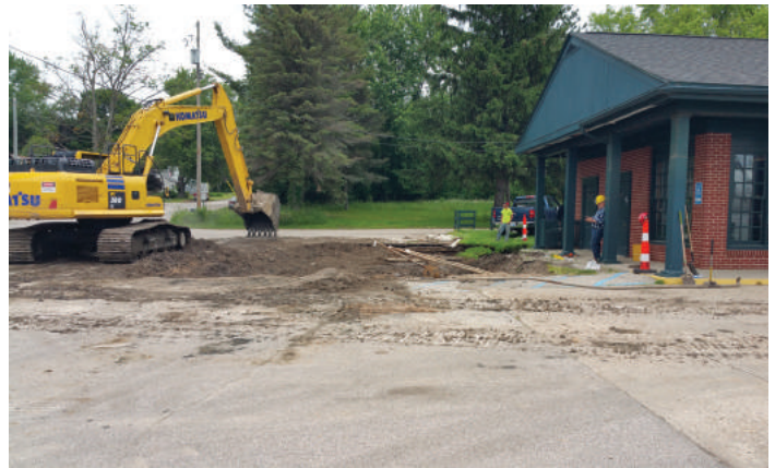
Blarney Castle proceeds with demolition of the gas and diesel tanks, pumps and pipelines from the Spirit and EZ Mart locations in Onekama.